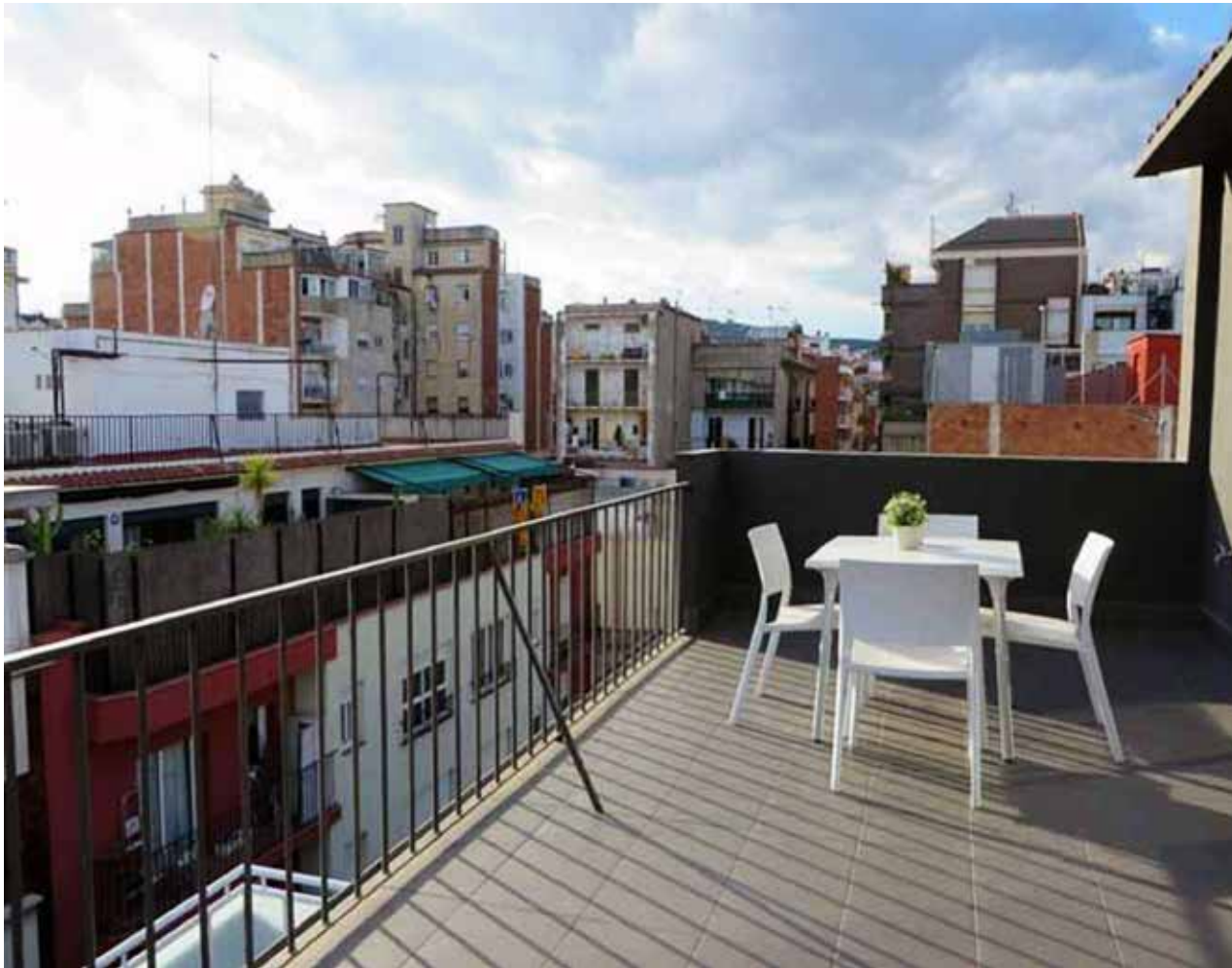
Charming view. Boom shakalaka.