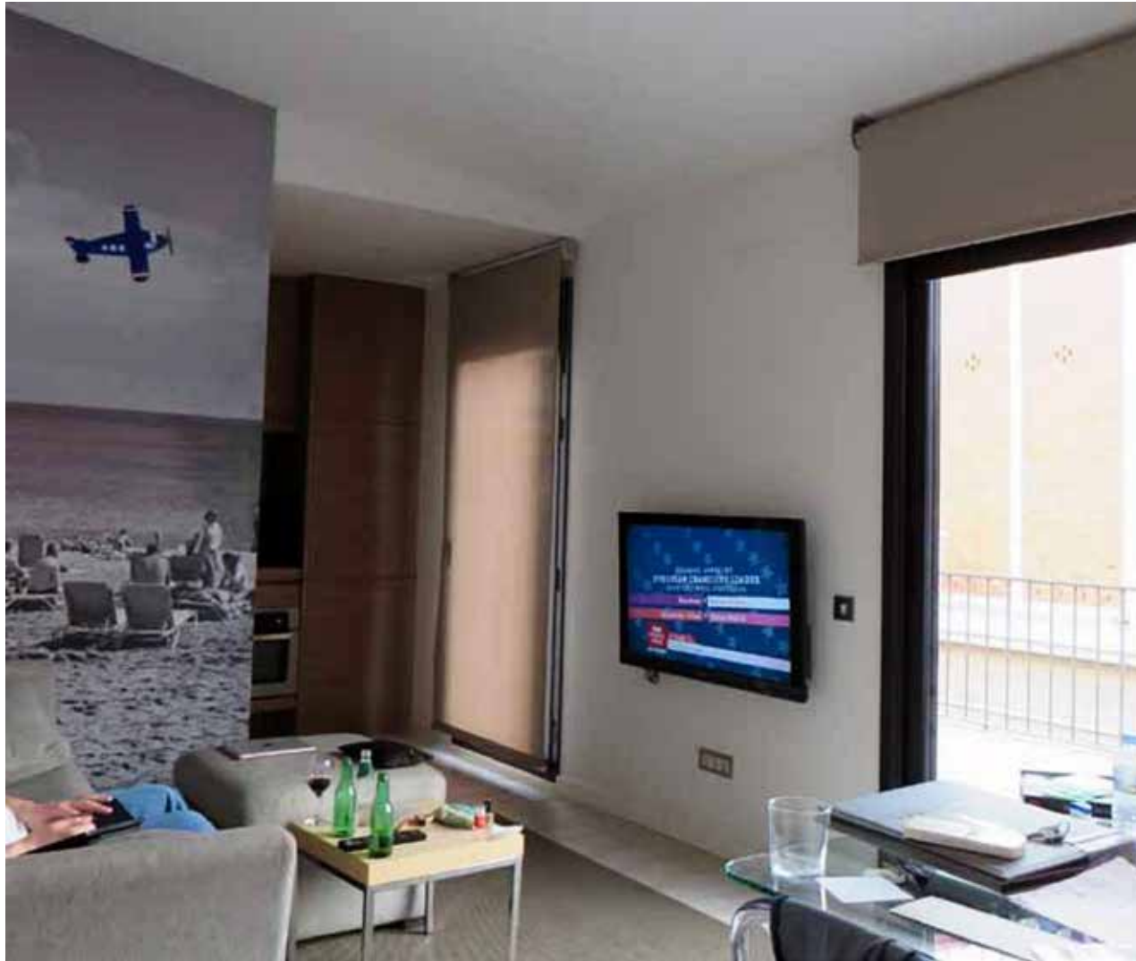
Front terrace. Boom.

Dining, living, chillaxing area with television and a cool airplane mural on one wall. Free Wi-Fi. Unfettered.